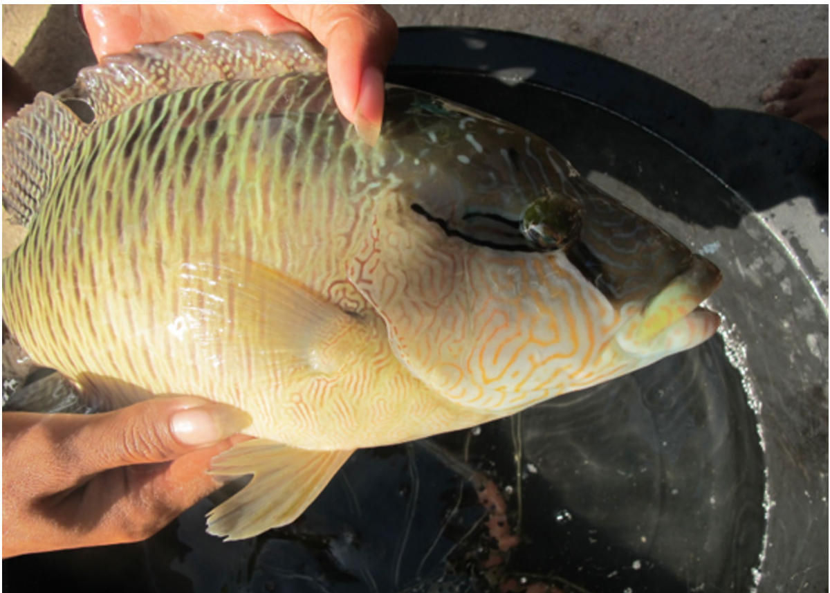
Fig. 1 A juvenile humphead wrasse ( Cheilinus undulatus ) was caught by fishers in Spermonde

Second, endangered species are internationally protected through CITES (CITES 1975). CITES prohibits the trade of protected wild fauna and defers violators to be subject to national legislation. Indonesia