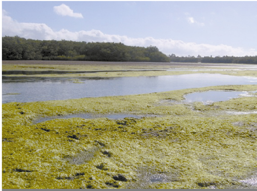
FIGURE 4 | Extensive algal bloom resulting from excess nutrients from shrimp farm effluents in the Jaguaribe River Estuary, Northeast Brazil.

For example, in the Jaguaribe Estuary, a major shrimp production area in Ceará State, anthropogenic P emissions increased by 30% to 43.9 \text{ t yr}^{-1} , between 2001 and 2006, following the expansion of shrimp farms (Marins et al., 2011). Further expansion of local farms increased emissions to 69 \text{ t yr}^{-1} in 2013 (Marins et al., 2020), representing over 60% of the total P emissions to the lower Jaguaribe Basin. Algal blooms are now frequently observed in this estuary ( Figure 4 ).