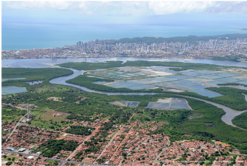
FIGURE 3 | Large mangrove cleared areas by shrimp farms at Potengi Estuary, Rio Grande do Norte State (Northeast Brazil). The mangrove island at the center-right of the image was almost totally converted to ponds.

in the forest drainage basin increase 10-fold to about 3,400 ha. It is interesting to note that there was no clear conversion of mangroves to shrimp ponds, but the occupation of tidal flats behind the mangroves has apparently affected hydrological processes, resulting in decreasing health of the mangrove fringe ( Supplementary Figure 1 ). Unfortunately, this reduction in health is not computed as mangrove area loss reported in the literature, suggesting that more than 8% to 10% of mangrove forest loss relative to shrimp pond area, normally accepted as converted, is affected by hydrological changes promoted by pond installation in this region. Considering these results and the areas with NDVI < 0.1 ( Supplementary Figure 2 ), literally equivalent to bare soil, between 9.6 and 14.4% of the local mangrove total were significantly affected by shrimp aquaculture.