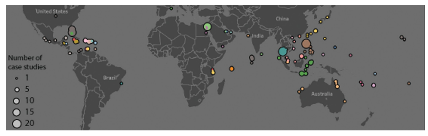
Fig 1. Location of coral restoration case studies included in the review. Restoration case studies occur in 56 countries, with most countries that have substantial coral reef area having at least one case study. Data points are coloured by country.

those cases where a single paper describes several different projects or methods, these were split into separate case studies. Finally, we consulted prior reviews of coral restoration to obtain case studies from their reference lists.